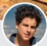
Bl Carlo Acutis