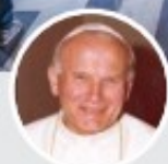
St John Paul II